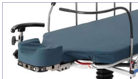
Flexible tube doubles as air delivery and drape support.