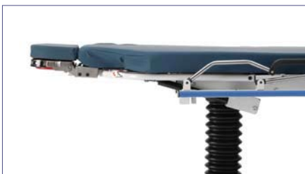
Enhanced-clearance, dual-articulating headpiece maximizes surgical access.

Stryker's eye surgery stretcher offers the greatest head-end clearance in the industry, giving surgeons ample leg room to maneuver while performing delicate eye procedures. The firmly-locking work surface and mobile design combine to increase patient security and surgical throughput.