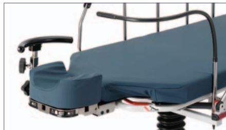
Flexible tube doubles as air delivery and drape support.