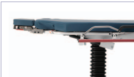
Enhanced-clearance, dual-articulating headpiece maximizes surgical access.

Stryker's eye surgery stretcher offers the greatest head-end clearance in the industry, giving surgeons ample leg room to maneuver while performing delicate eye procedures. The firmly-locking work surface and mobile design combine to increase patient security and surgical throughput.