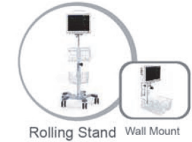
Rolling Stand Wall Mount

The iM8 series put reliable monitoring technologies at your finger tips. With their accurate readings and optimized performance, the iM8 series can meet basic monitoring needs, bringing easy access to high-quality healthcare for everyone.