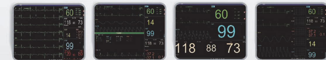
3/5-lead ECG Analysis