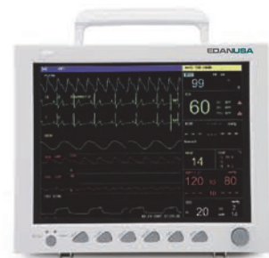
iM8 Series Patient Monitor