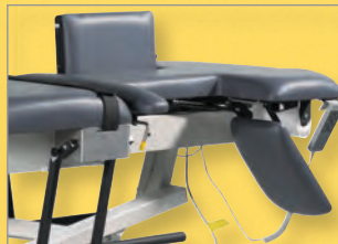
Industry's largest cardiac scanning cutout