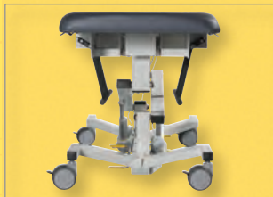
Closer patient access