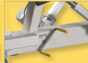
Maintains table stability