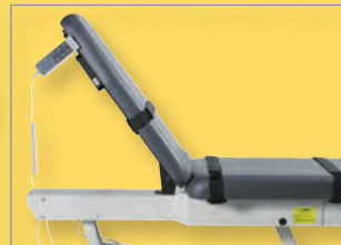
Infinitely adjustable to 80 degrees