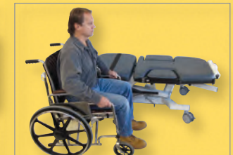
Table adjusts down to 23"