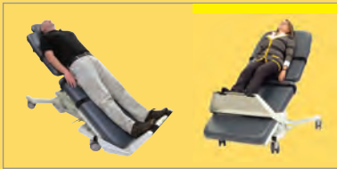
Accommodates patients of various heights