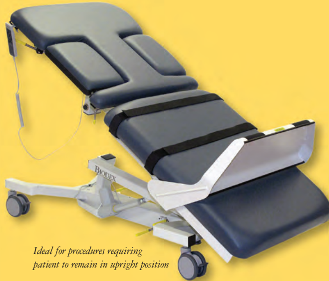
Ideal for procedures requiring patient to remain in upright position

When not in use, the foot support conveniently tucks beneath the table allowing clear access to the tabletop. If necessary, it can be removed from the table completely.