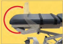
Foot support tucks beneath the table, providing clear access to the tabletop