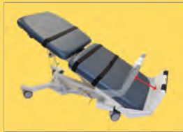
Adjustable every 2", up to 14"