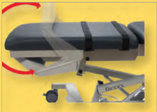
Accommodates patients of various heights