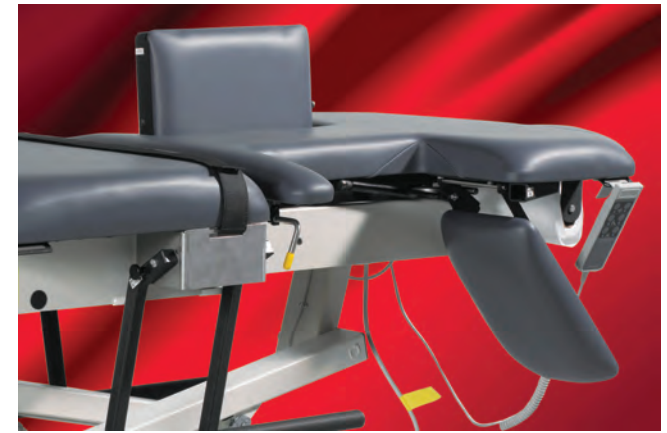
Largest cutout in the industry, 15.75" l x 9.5" w