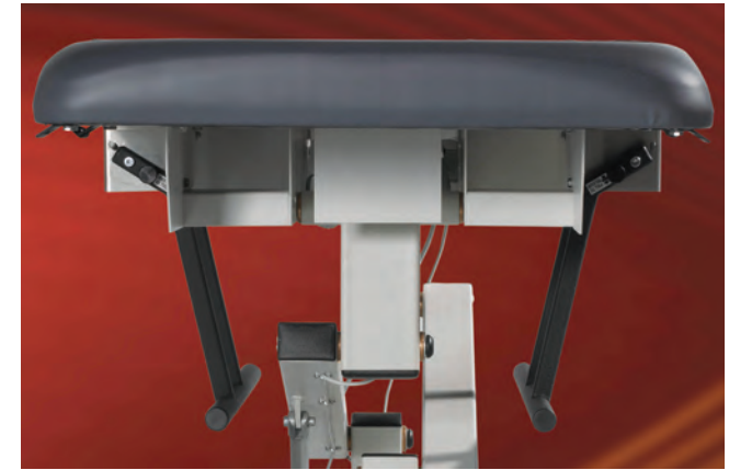
Optional side rails tuck beneath the table when not in use to allow clear access to the tabletop.